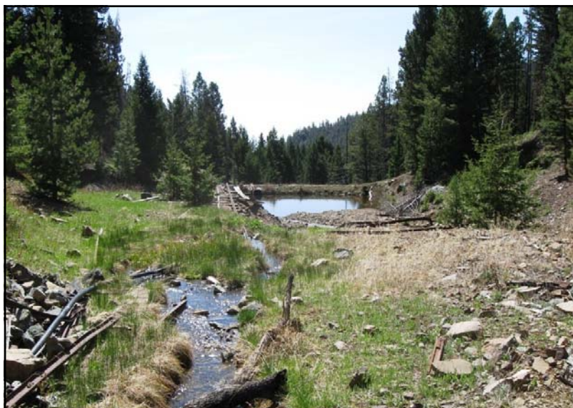
View of sediment pond from Mason Adit looking south.

Previous reclamation activities were completed at the Park Mine site in 1997 and 1998. The purpose of the reclamation project included limiting human, livestock, wildlife, and environmental exposure to heavy metals present in surface soils at the site. The reclamation was also designed to reduce the mobility of the contaminants to limit potential impacts to local surface water and groundwater resources. The reclamation project involved consolidation of tailings and waste rock dumps in a mine waste repository. Several waste rock dumps were regraded in-place, covered with clean topsoil and revegetated.