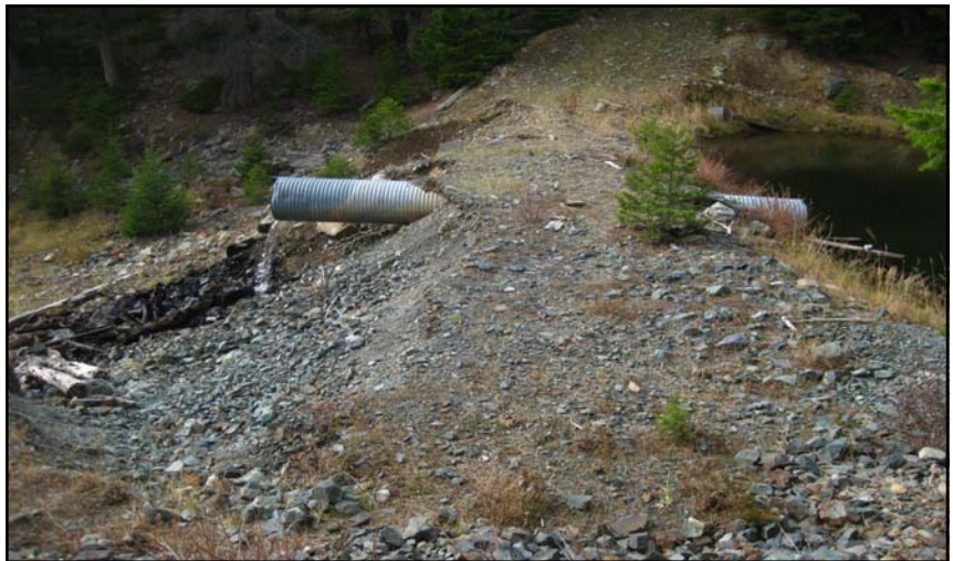
View of dam looking southwest.

The Montana Department of Environmental Quality (DEQ) is issuing this update to keep you informed about upcoming construction activities in the Elkhorn Mountains. In August 2015, Abandoned Mine Lands (AML) will start restoration activities at Park Mine. Park Mine is located in the Helena National Forest, 12 miles west of Townsend, MT on Indian Creek Road. Historically, several mines were developed within the Indian Creek Mining District, including the Gold Dust, Little Annie, Bullion King, Park/New Era, and Venezuela Mines.